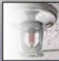
Fire Detection Systems